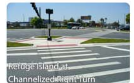
Refuge Island at Channelized Right Turn