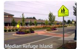
Median Refuge Island